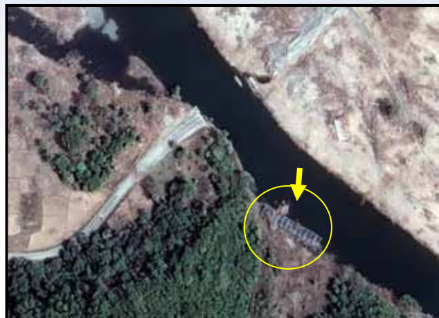
Destroyed Bridge and Road