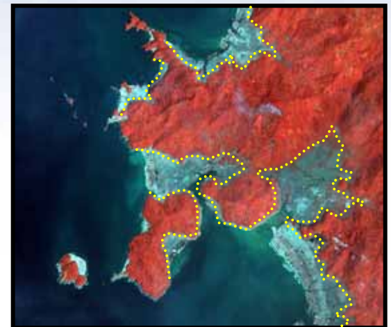
Near-Infrared Image of Eroded Coastline (50km SW of Banda Aceh)