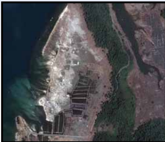
40km SSW of Banda Aceh 2 January 2005

QuickBird Satellite Imagery January 2, 2005